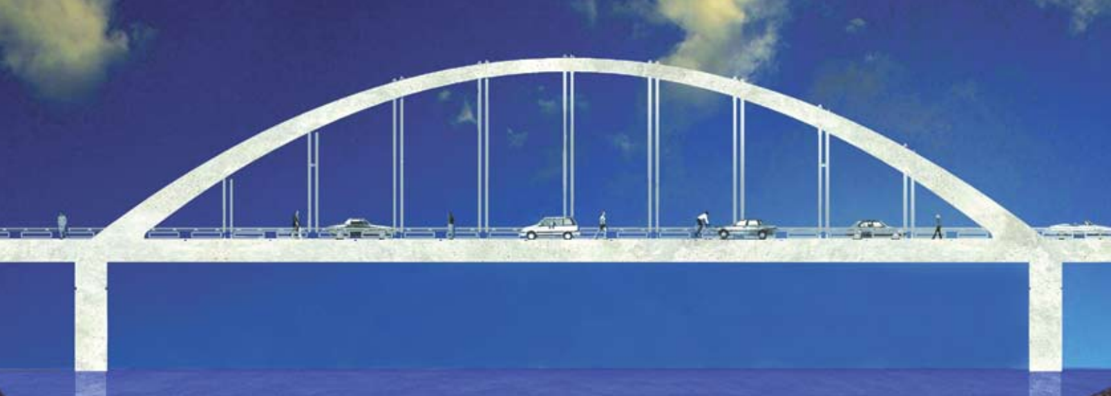
The new Norridgewock Bridge will incorporate key aspects of the old structure, particularly the old bridge's arch design, which consisted of concrete tied-arch spans.

The new Norridgewock Bridge is a somewhat unconventional structure from a design standpoint. Conventional arch bridges are commonly anchored into bedrock at either end. The new bridge arch will rest on piers in the river, with the arch thrust supported by a tie underneath the roadway. The tie will be a cast-in-place concrete member that will be post-tensioned in stages as additional load from other structural components is added.